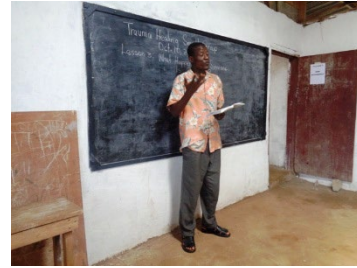
Teaching the Saturday class