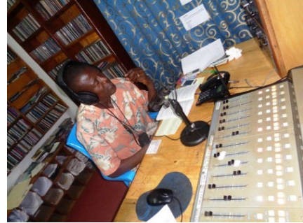
On air at Radio ELWA (94.5 FM)