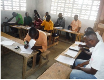
One of the trauma healing small group classes