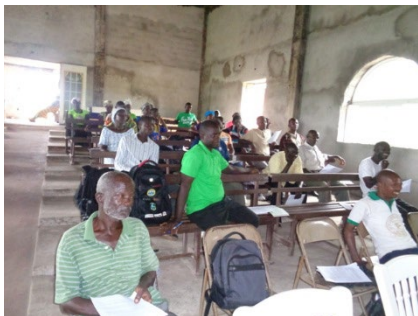
Participants during the leaders' training