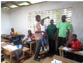
Illustrating a point during trauma healing class