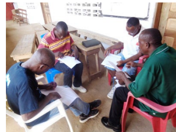
Small group session during class